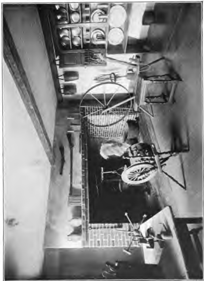
THE OUTER KITCHEN